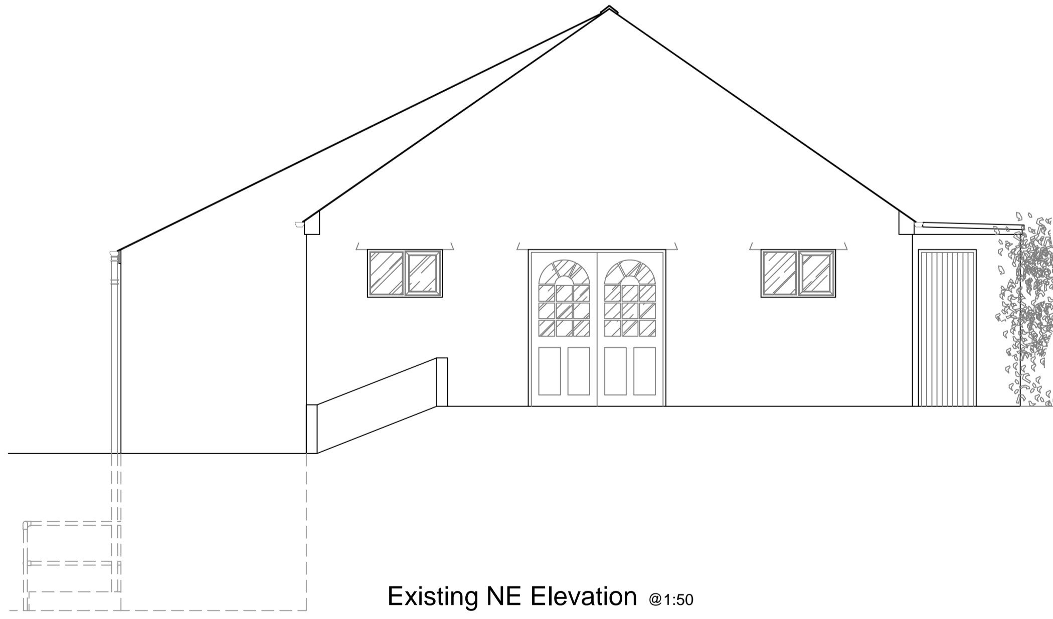
Existing NE Elevation @1:50