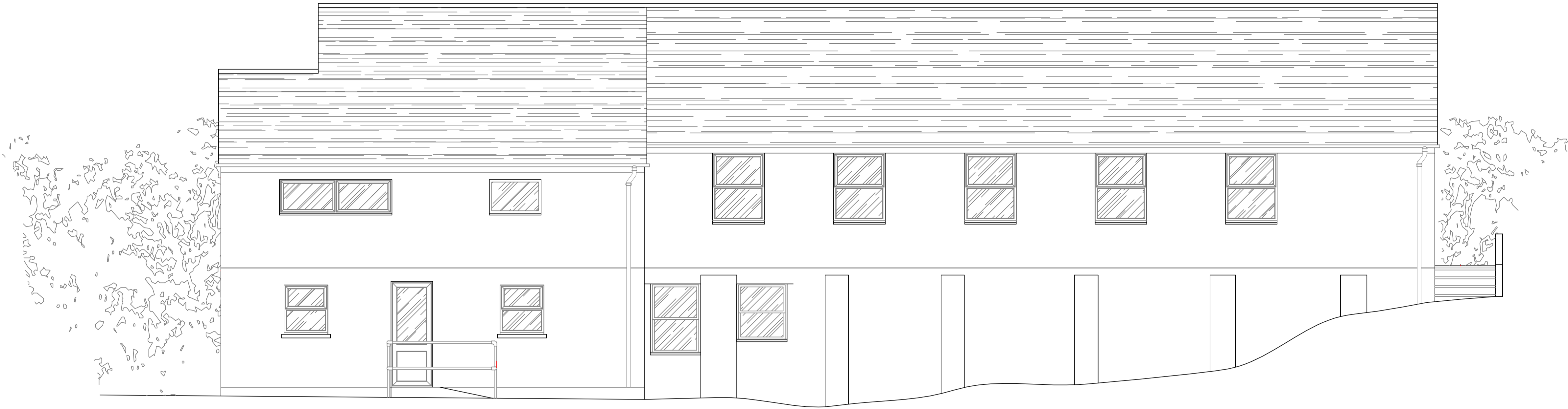
Existing SE Elevation @1:50